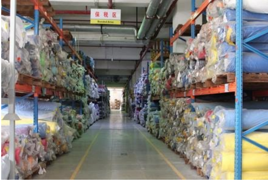
Figure 2 - Store for Fabrics