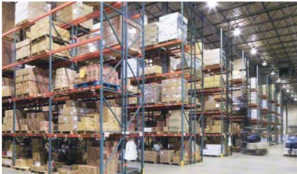
Figure 1- Store for Accessories

The fabric and accessories stores department is centralized in apparel industry and all the fabric and accessories comes to this unit first from the supplier and audited here and kept until it is distributed to other units. For an export oriented and bulk production of garment industry , it is essential to maintain a well-organized & well equipped inventory system. The main responsibility of this department is to store all the raw material necessary to produce garments. This department is sub divided into three sections. Store keeper follows a strong and appropriate working procedure.