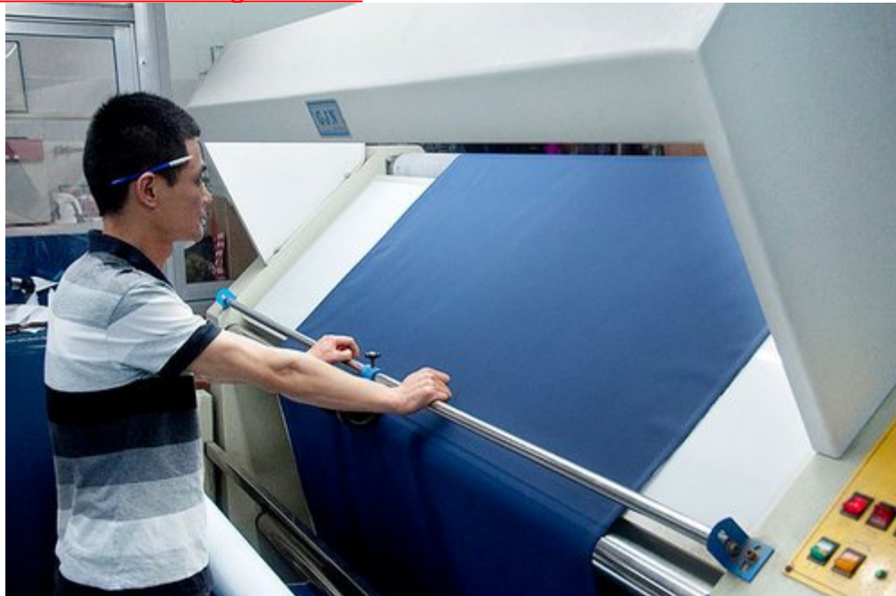
Figure 3 - Fabric Inspector Inspecting Fabrics