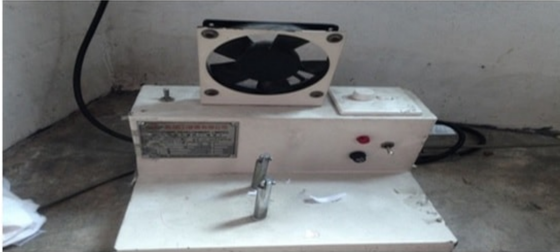
Figure 4 - Heat wear label cutting machine